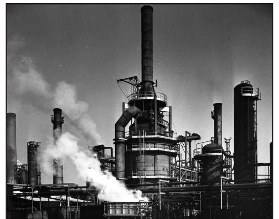
Brooklyn Refinery 1931

The Center for American History The University of Texas at Austin.