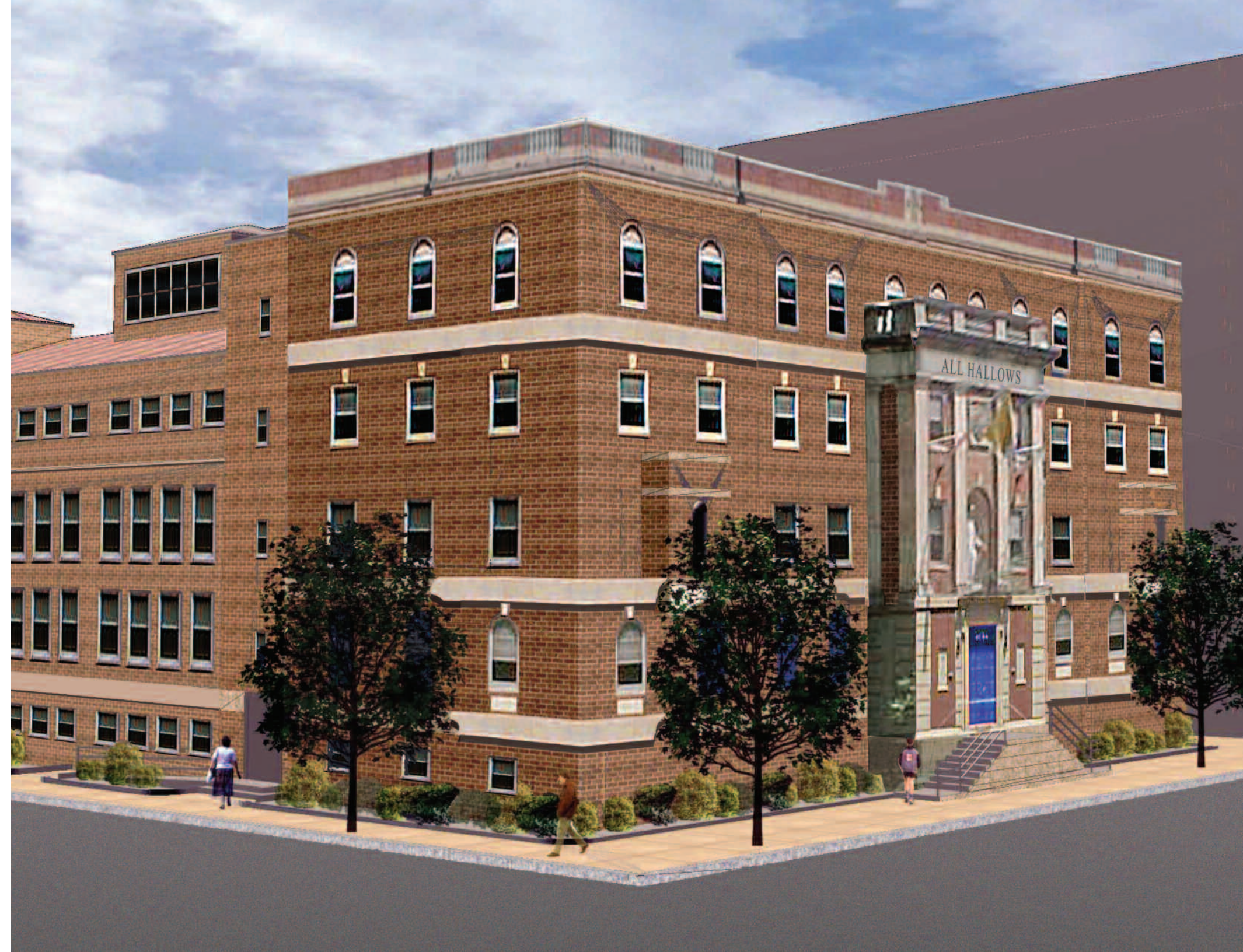
Architects' rendering of All Hallows High School renovation.